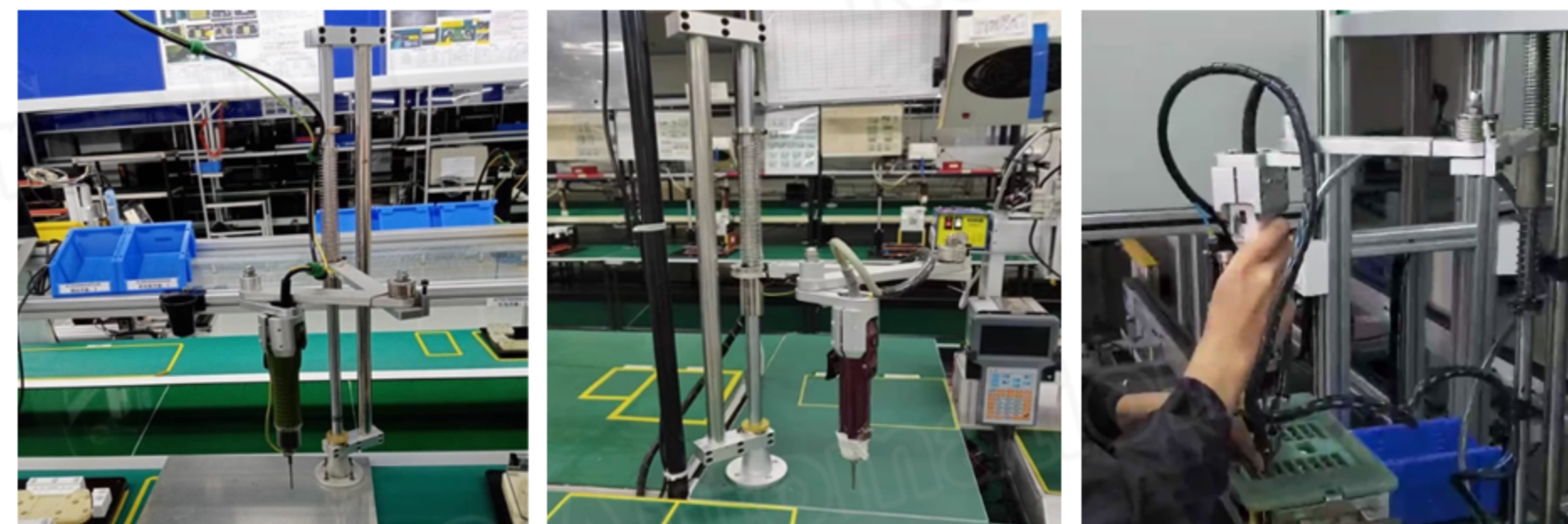
Vertical bracket for electric screwdriver, matched with screw machines.

RS AUTOMATION CO.,LTD. Room 301-1, No.639-6 Er huan nan road, Tong an district, Xiamen City, China. Web: www.cable-peeler.com Tel: +86-592-7126865/67