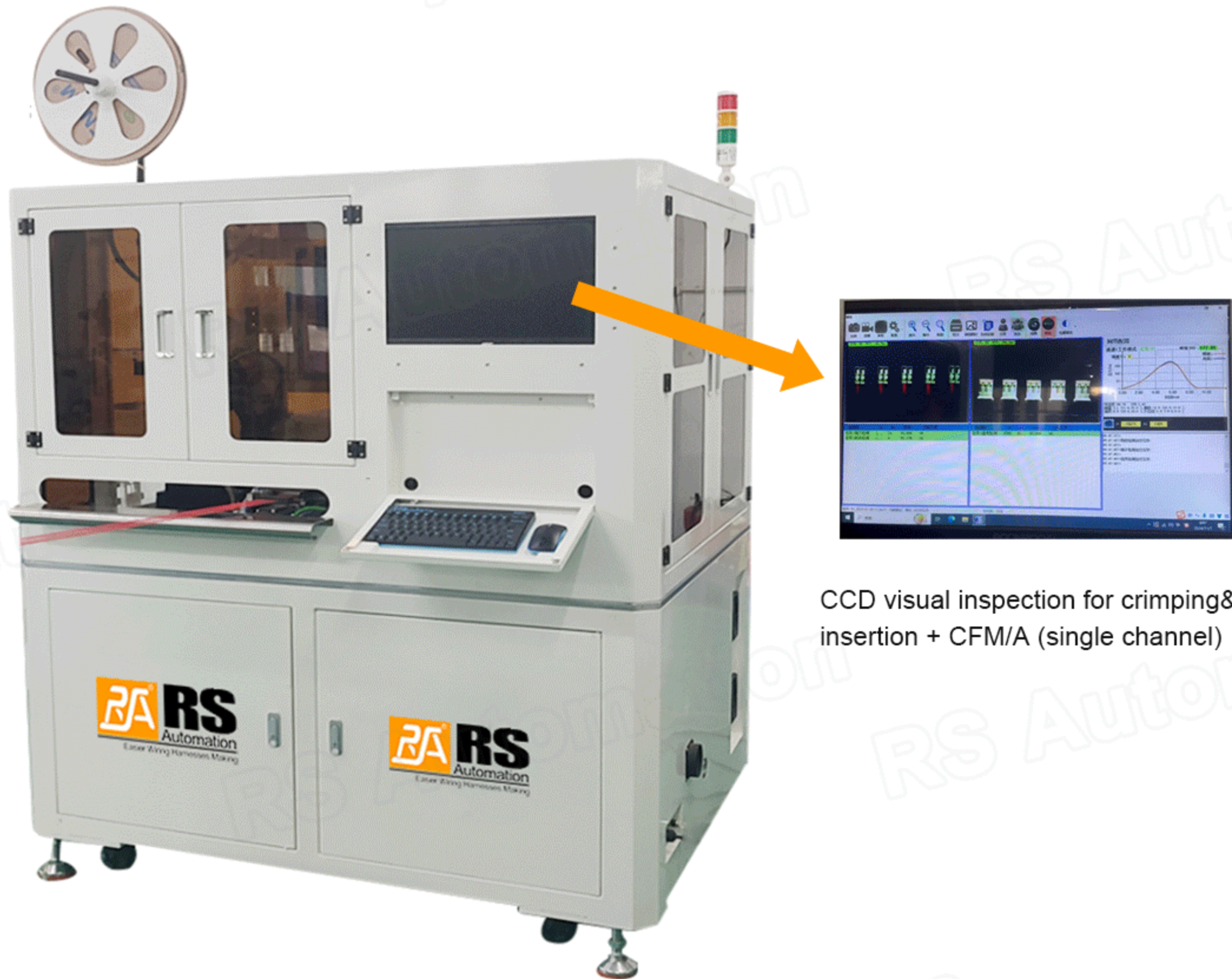
CCD visual inspection for crimping&housing insertion + CFM/A (single channel)